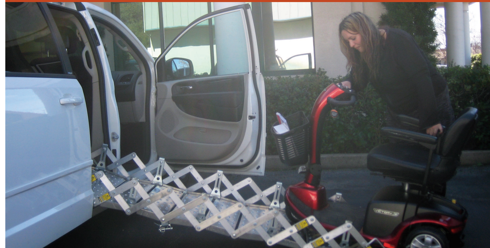
With batteries replaced this scooter is getting delivered to its new owner.