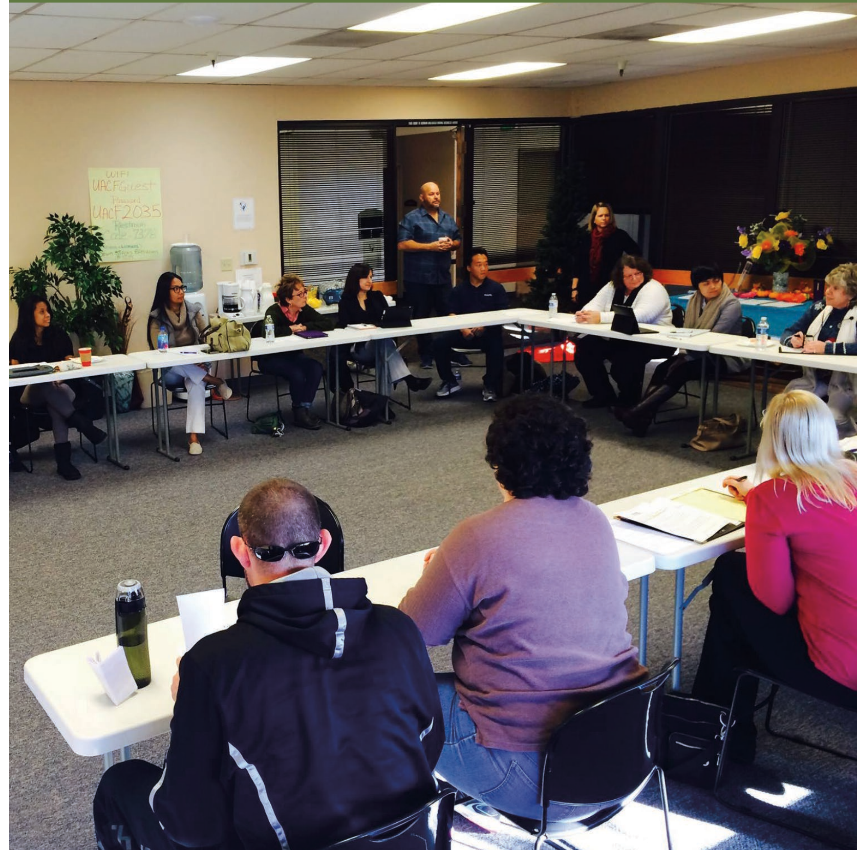
Ability Tools Regional Meeting discussing outreach strategies.